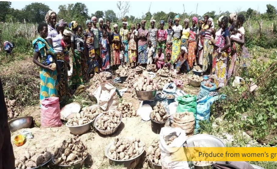
Produce from women's group community garden