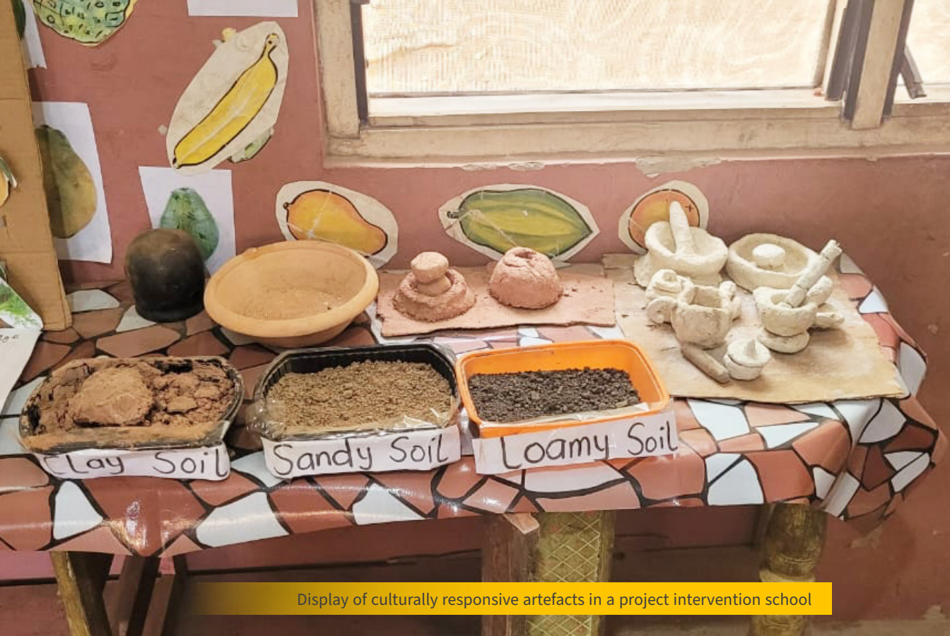
Display of culturally responsive artefacts in a project intervention school