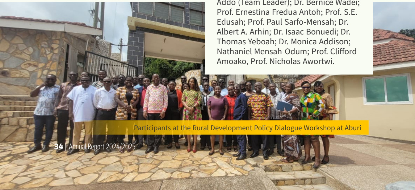
Participants at the Rural Development Policy Dialogue Workshop at Aburi