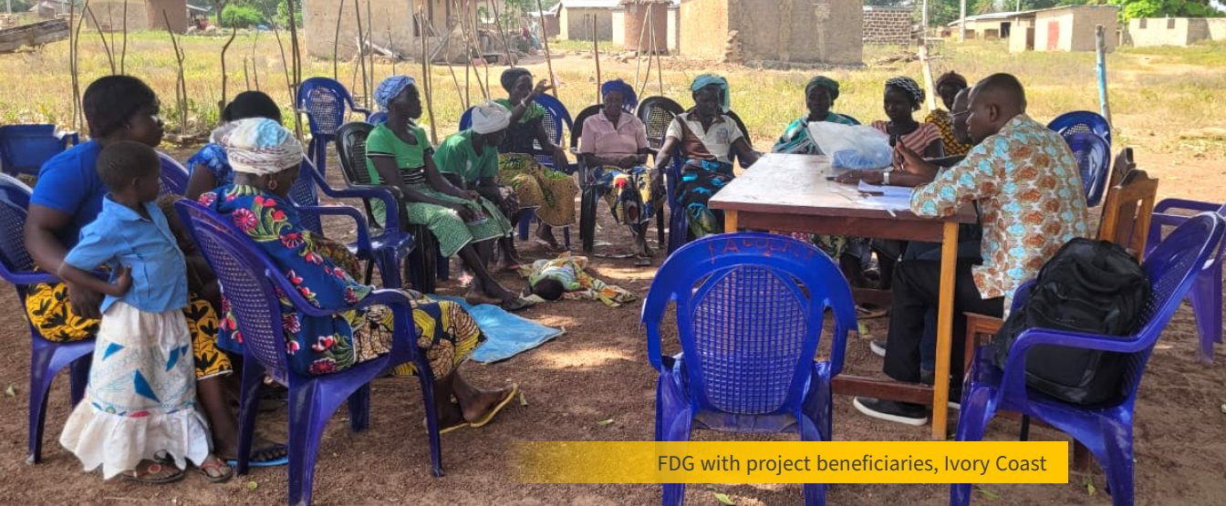
FDG with project beneficiaries, Ivory Coast