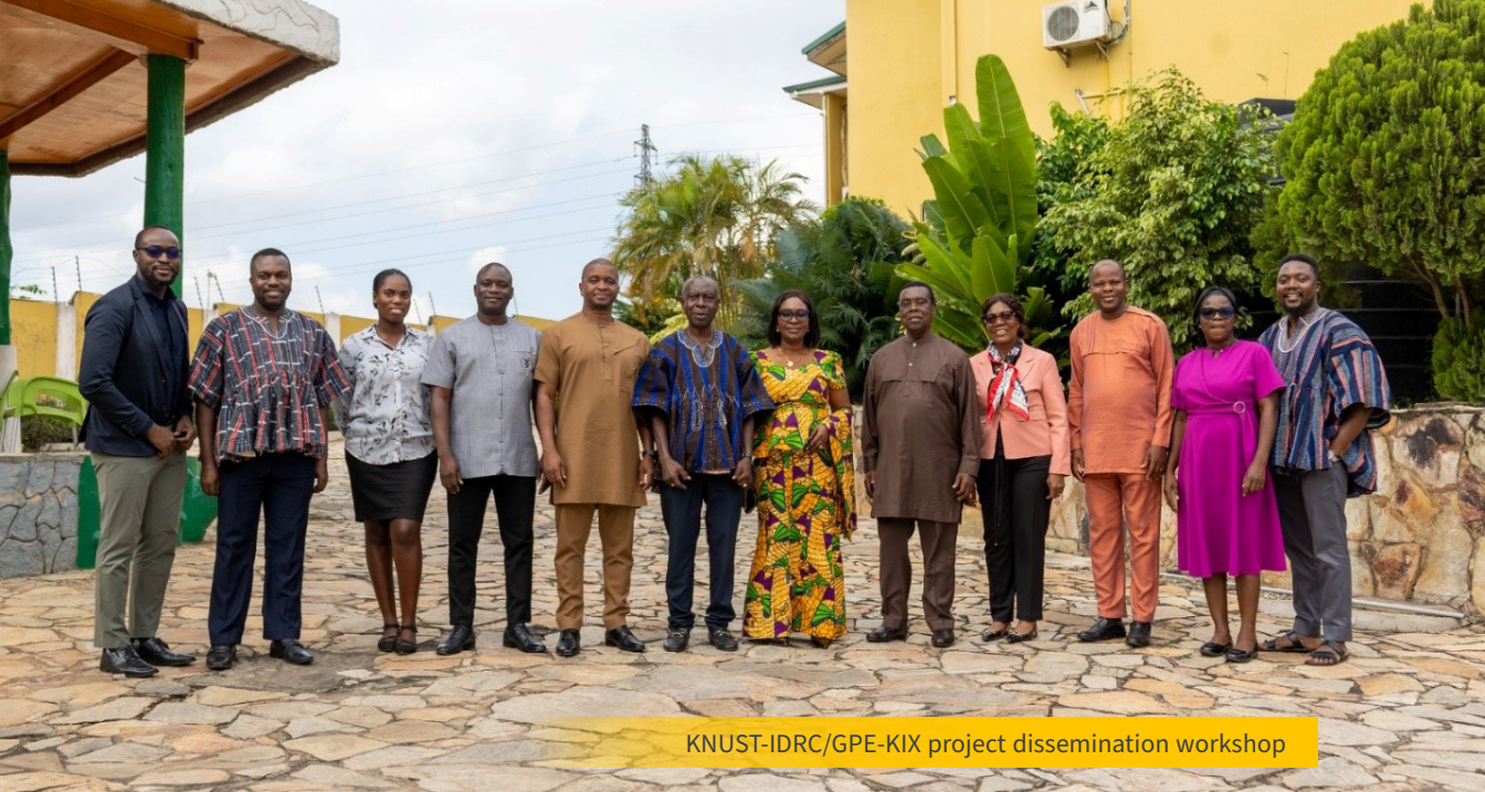
KNUST-IDRC/GPE-KIX project dissemination workshop