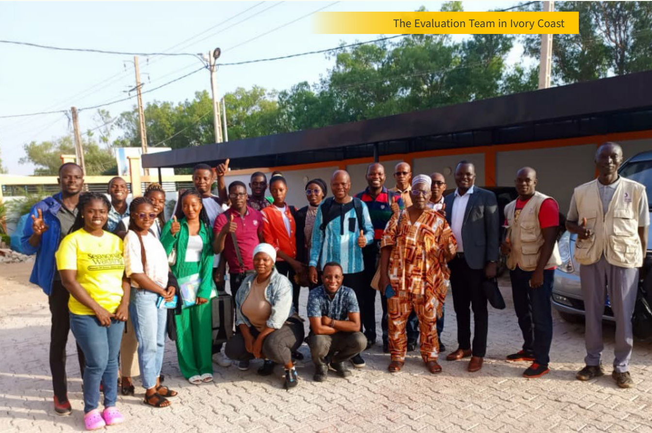
The Evaluation Team in Ivory Coast

land tenure for community gardens, and increasing engagement with men to address gender norms influencing household nutrition. Expanding collaboration with local institutions and improving irrigation systems were also recommended as opportunities to scale the project's impact and ensure long-term benefits for participating communities.